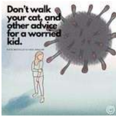
Don't Walk Your Cat & Other Advice for a Worried Kid

Free children friendly ebooks available to download (Click on book title or book cover)